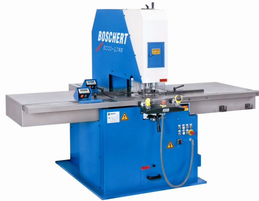
(Profile Version for working angles, channel, etc.)

Two-axis digital readouts can be mounted to any EL-series machine to assure high accuracy and increase productivity. The system is battery operated to eliminate cables and features high precision magnetic scales giving accuracy to 0.004". The system is easy to use and is ergonomically designed to offer operational comfort.