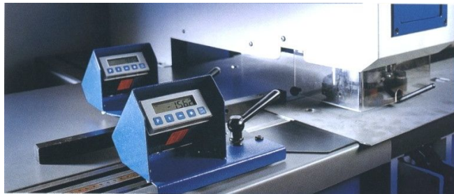
Optional Digital Readout

The tool set consists of the punch, die and stripper and is changed in less than 10 seconds. The largest tool diameter is 4" or any shape fitting within. Tool regrinds are compensated by the adjustable stroke length.